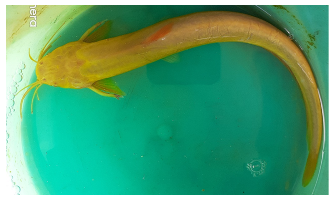
Fig.2A: Live specimen of Heteropneustes fossilis (Bloch, 1794)

(Linnaeus, 1758) from Midnapur is the latest reported albino catfish from the study area. Beside these, albinism in Indian catfishes was also reported by Gupta and Bhoumik (1958) for Arius jella Day, 1877 From Diamond Harbor, West Bengal.