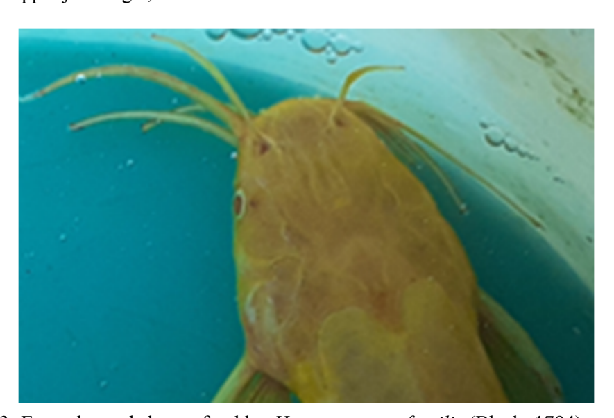
Fig.3: Eye color and shape of golden Heteropneustes fossilis (Bloch, 1794)