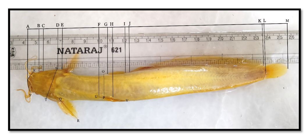
Fig.2B: Measurements, AM=Total length, AL=Standard length, AD=Head length, BC=Eye diameter, AB=Snout length, AF=Pre dorsal length, AE=Pre pectoral length, AG=Pre pelvic length, AJ=Pre anal length, UV=Dorsal fin length, QR=Pectoral fin length, GI=Pelvic fin length, JK=Anal fin length, LM=Caudal fin length, OP=Body depth, AC=Post orbital length, XY=Upper jaw length, ST=Head wide